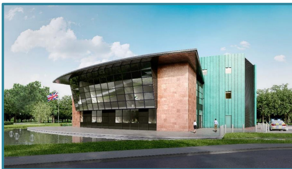
Construction on the Eden Deployment was completed in January 2020 (design image)