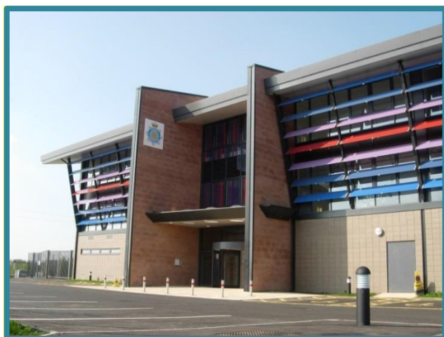
North Cumbria Territorial Policing Area HQ – Carlisle

There are two categories of leases: Operating leases are where the risks and rewards of ownership stay with the lessor and the annual rental charges are charged through the CI&ES Finance leases are where the risks and rewards of ownership are transferred to the lessee and where the assets are recognised on the balance sheet of the lessee.